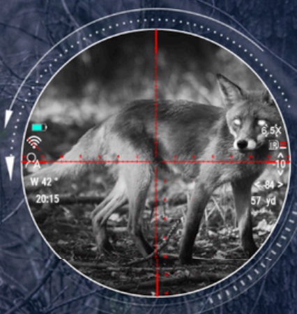
After image shift zero